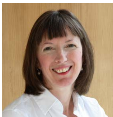
Frances O'Grady is General Secretary of the TUC